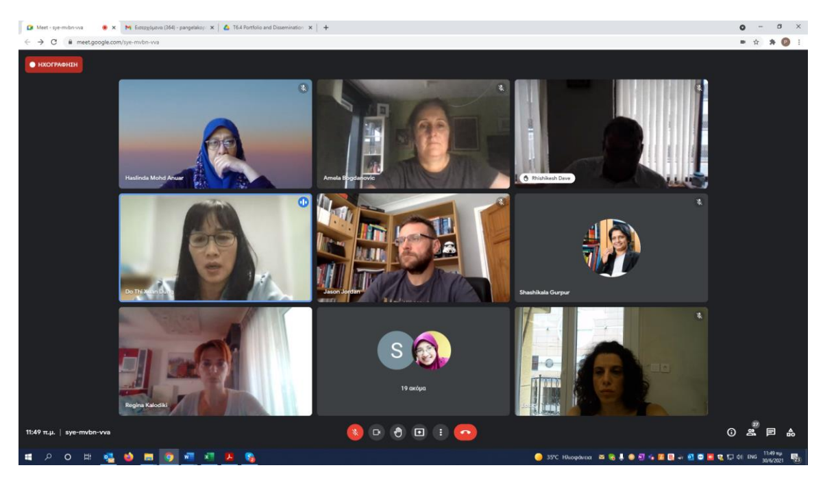
Team Leaders during Kick off Meeting